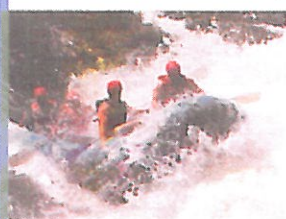
White Water Rafting