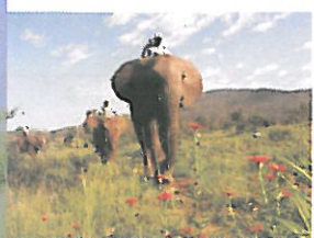
Elephant - Back Safaris